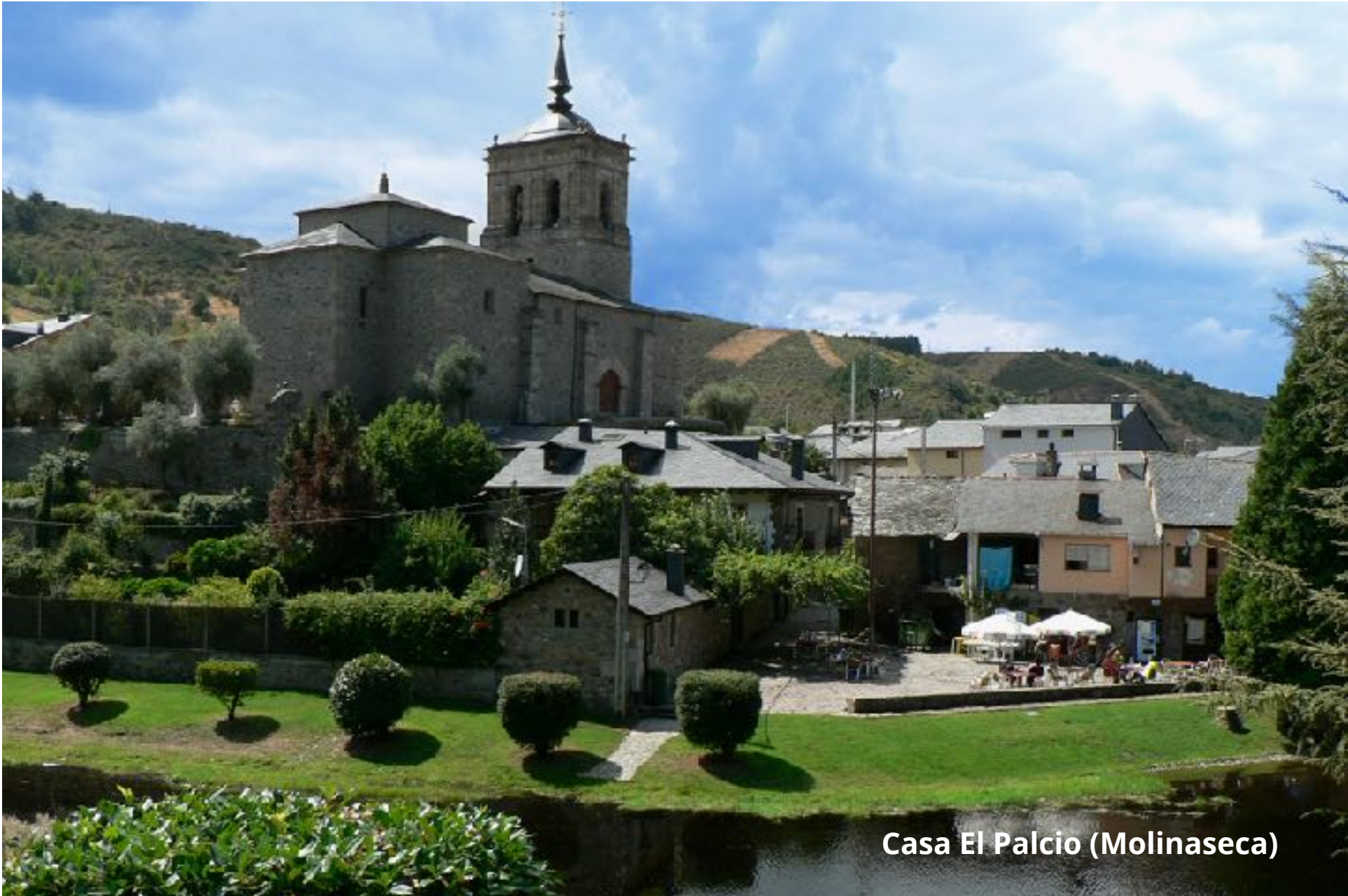
Casa El Palcio (Molinaseca)