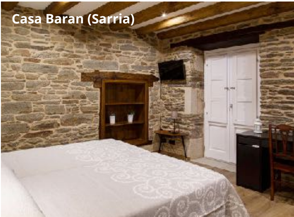
Casa Baran (Sarria)