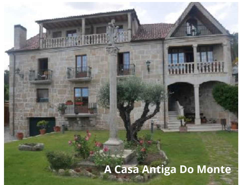
A Casa Antiga Do Monte