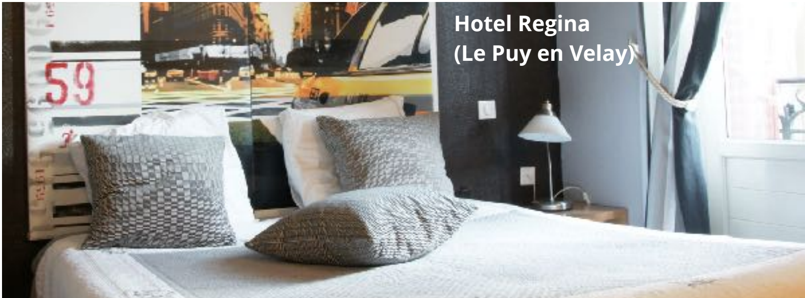
Hotel Regina (Le Puy en Velay)

While being more modest than the accommodation on the other Caminos, the Le Puy Camino offers wholesome comfort in great locations for you to relax and enjoy.