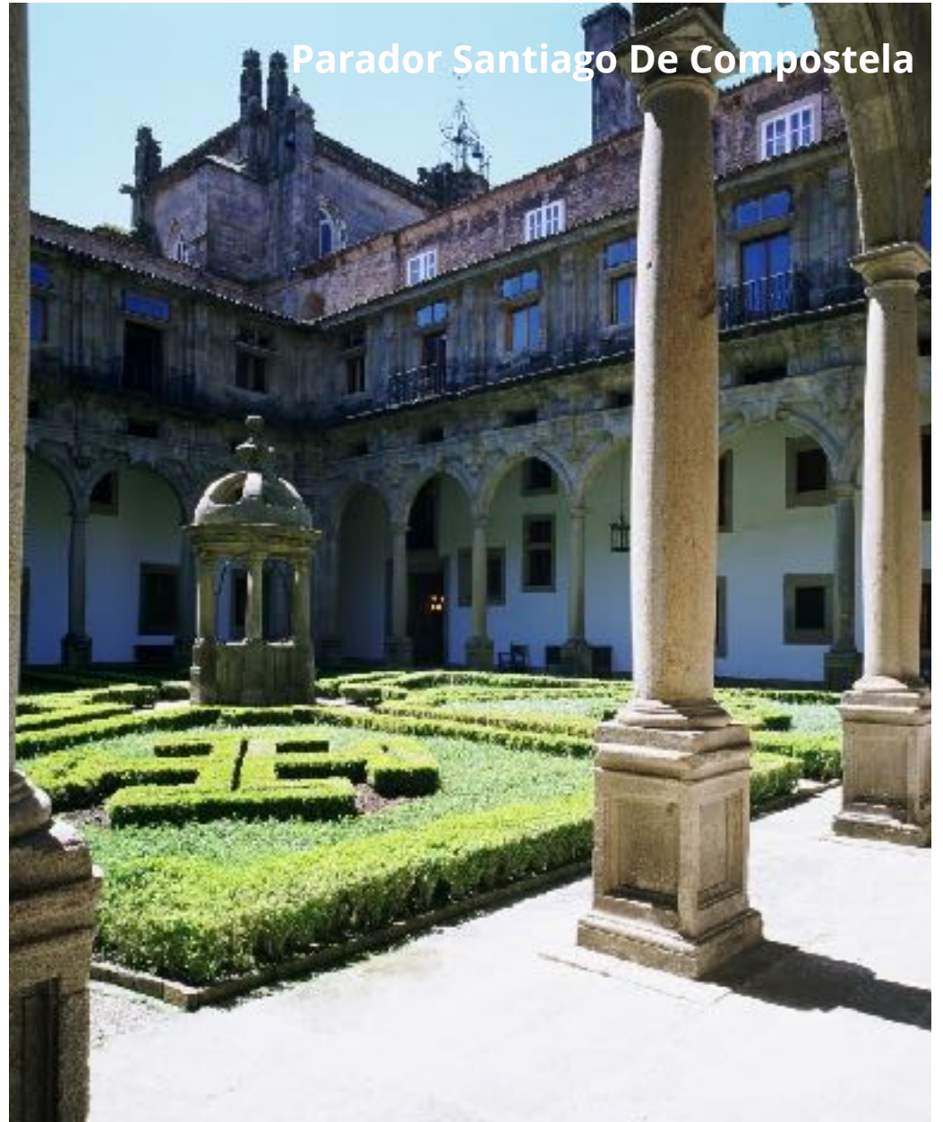
Parador Santiago De Compostela