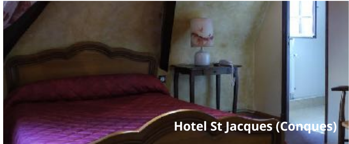
Hotel St Jacques (Conques)