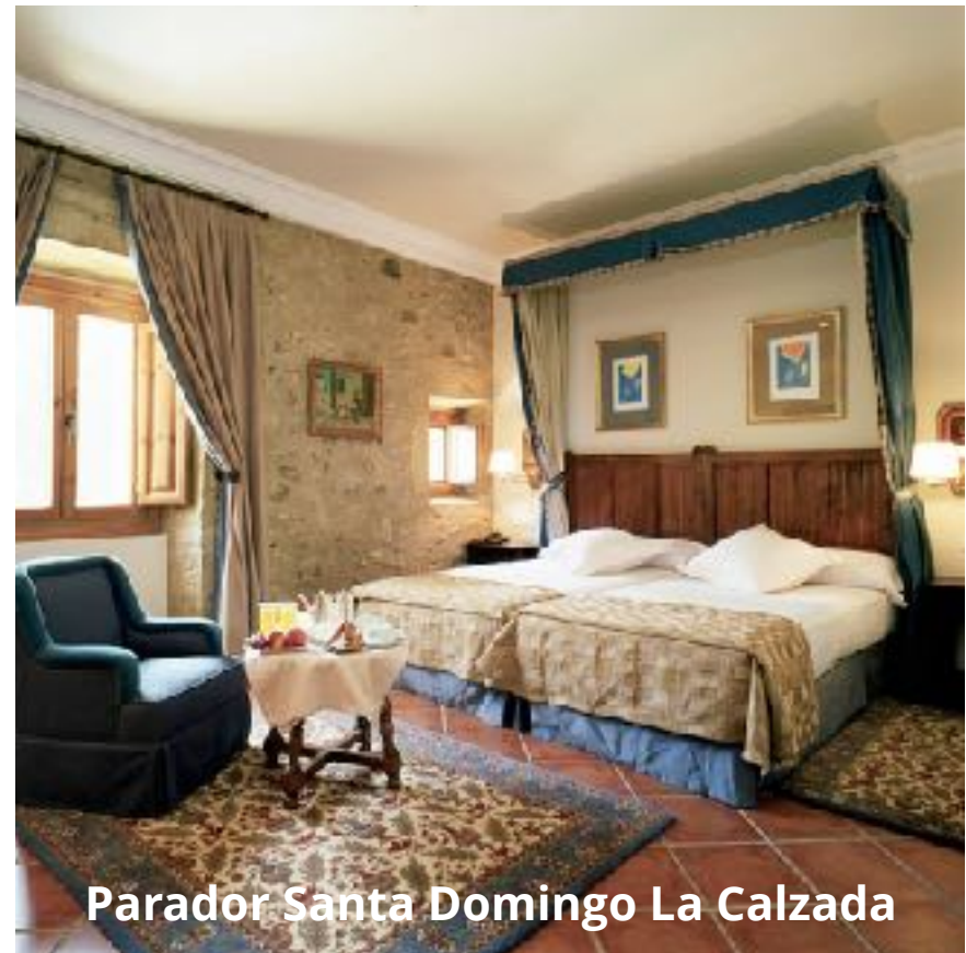
Parador Santa Domingo La Calzada

Paradors are historical buildings of significance such as monasteries or hospitals that have been refurbished into luxury boutique hotels. They provide a once-in-a-lifetime experience with first-class service, excellent facilities and gourmet dining.