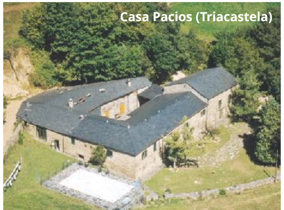
Casa Pacios (Triacastela)