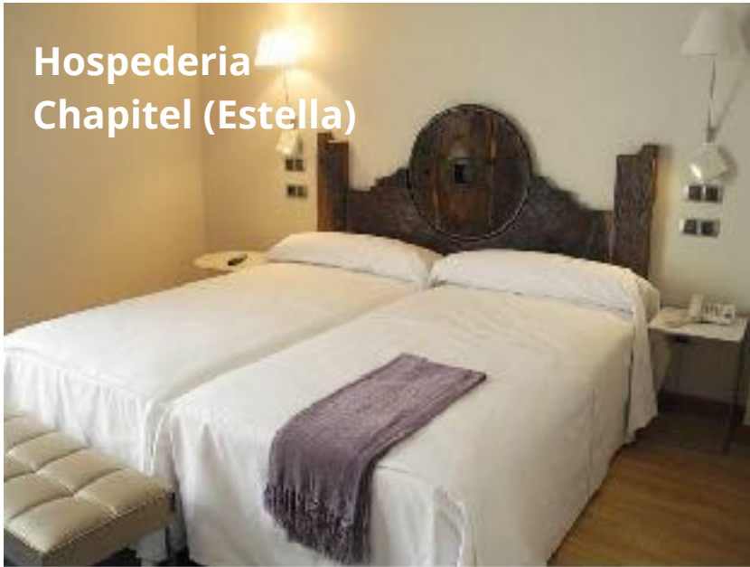
Hospederia Chapitel (Estella)