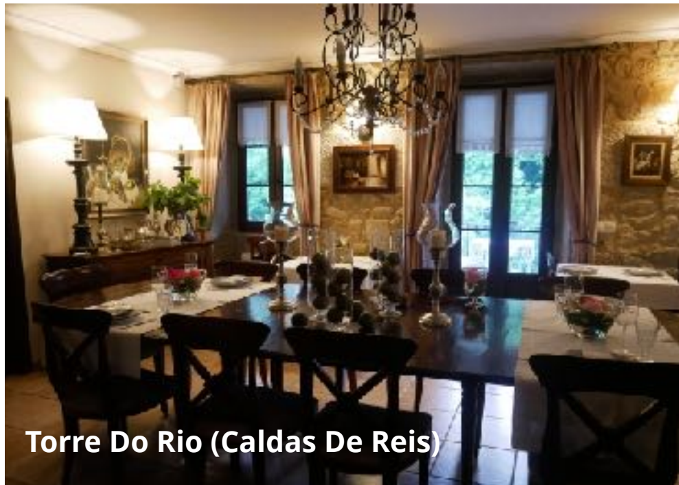
Torre Do Rio (Caldas De Reis)