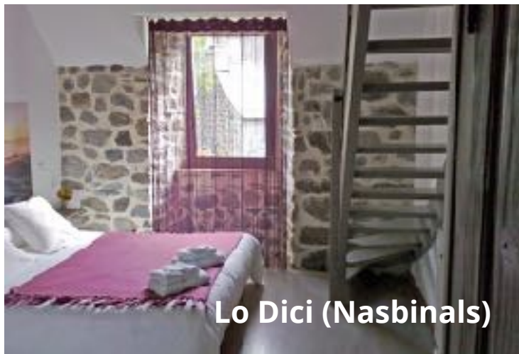
Lo Dico (Nasbinals)