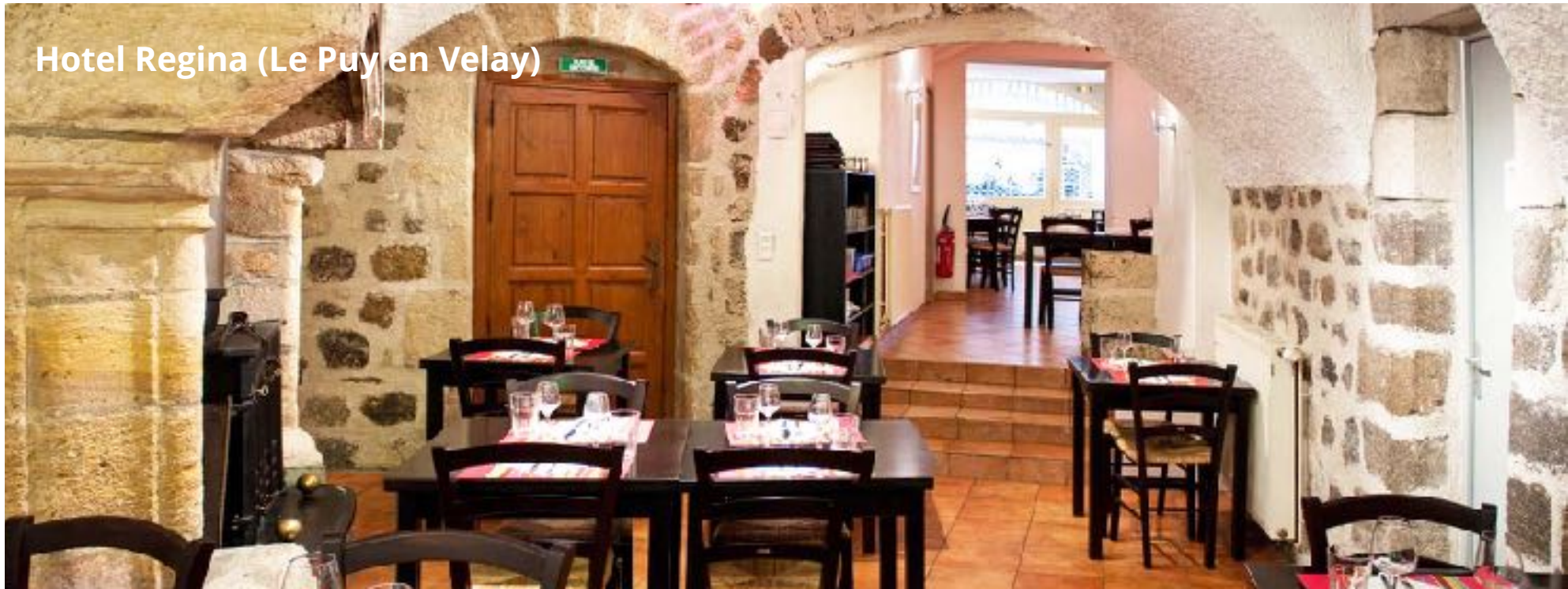
Hotel Regina (Le Puy en Velay)