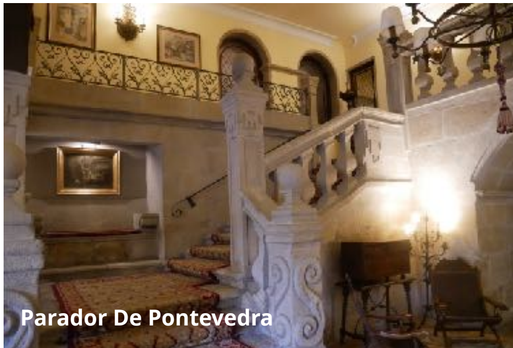
Parador De Pontevedra